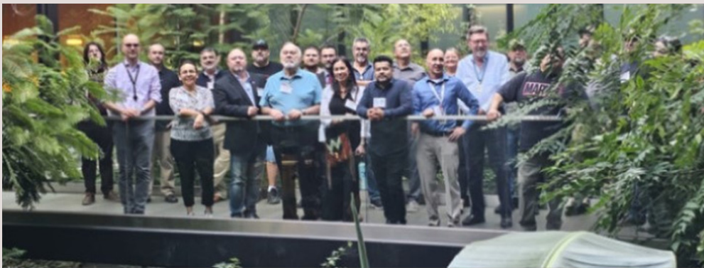
Photo: Spotlight on Equitable Tribal Transportation Research: Insights from the TRB National Tribal Peer Exchange. (2024). Photograph, https://www.cspace.csulb.edu/news/article/spotlight-on-equitable-tribal-transportation-research-insights-from-the-trb-national-tribal-peer-exchange

On January 7th, 2025, Western TTAP attended the Annual Transportation Research Board (TRB) Conference in Washington, D.C., representing tribes throughout the western region in partnership with the Standing Committee on Native American Transportation issues.