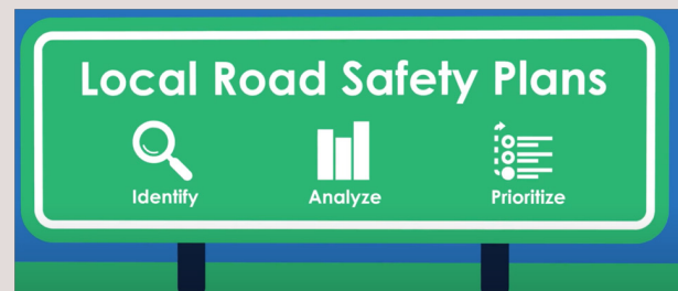
Photo: Federal Highway Administration. "Local Road Safety Plan." YouTube video, 2:32, published June 25, 2018. Accessed June 25, 2025. https://www.youtube.com/watch?v=Wzdm798Mo18

How does a tribal transportation safety plan benefit tribal communities? A transportation safety plan establishes a blueprint for the community that provides a safe and healthy way to assist local businesses. With smooth and dependable transportation initiatives in place, communities can count on plans that improve their daily life and make it a better place for all. On an organizational level, having a transportation safety plan in place with data-driven emphasis areas, a tribe can potentially unlock impactful funding opportunities.